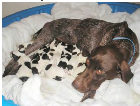
Ruth and Her Puppies

To me, that is the joy of driving transports... taking a dog or cat from a frightening, hopeless situation and delivering the animal to hope... Hell to Heaven. Returning to them their joy and the feeling that life is good gives rewards far beyond what I ever imagined would come when I first began transporting. Ruth's puppies were born on June 24th, just three days after her rescue.