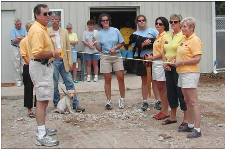
CSC volunteers and guests celebrate the grand opening of the K9 Cottage facility.

CSC celebrated the grand opening of their new facility, the K9 Cottage this July. The facility, located just outside Columbia, now houses our dogs in need of a foster or forever home. With this new spacious kennel, our adoptions have greatly increased and our dogs seem to be happier than ever. Every day, they get to run in exercise yards and have interaction with both people and other canines.